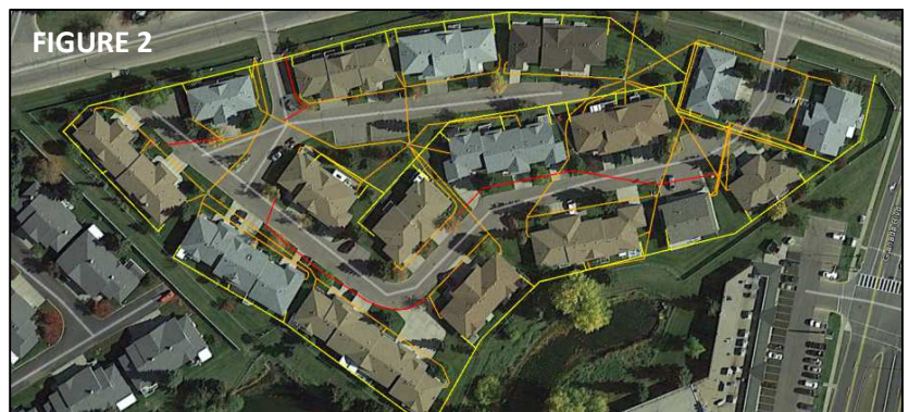
Figure 2: An example of taking the collected data and plotting it in programs such as Google Earth that can be accessed with mobile devices for onsite prints available 24/7.

RESULTS: Maverick was able to place all the facility locations on a PDF drawing originally provided by the drilling company. This created an entire map of the neighbourhood that could be provided back to the community board upon request for future reference. With additional Real Time Kinematics and Robotic Total Station technologies, Maverick can plot these into GIS files and CAD format. Additional technology such as Ground-penetrating Radar can be used to add more subsurface features for engineering or geophysical determinations.